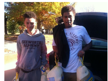
SeeWorthy Academy students help unload turkeys donated by KTBO and TBN.