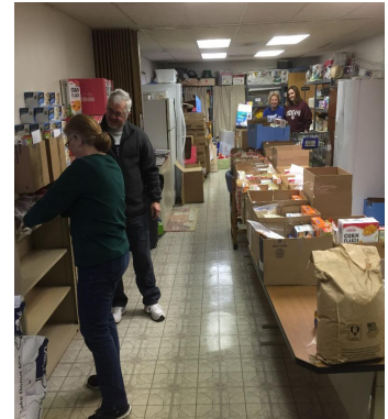
Volunteers help WCLJ's His Hand Extended outreach run smoothly.

WCLJ's own His Hand Extended outreach, well-known throughout the Indianapolis faith community, served over 590 needy individuals and families in November, providing food, clothing, and other necessities. Thanks to a local business partner, we received some much needed clothing for men. We also want to thank our many volunteers who help to make the His Hand Extended outreach run