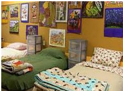
An example of the shelter provided by local churches.

We also welcomed Sabrina Vontress from the McClellan Family Shelter (pictured). This new facility can now house 13 families with children on any given night. One of the fastest growing populations of the homeless sector is families with children. Many people are only one paycheck away from homelessness and are forced to live in their cars with their children. This new facility opens up the chance for safe harbor for these families, as they search for permanent housing.