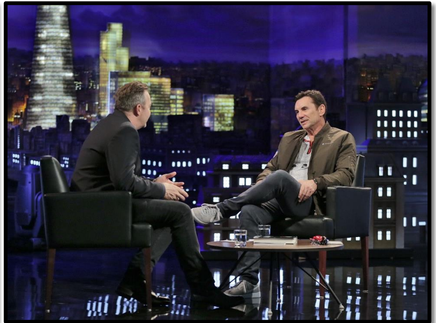
TBN Meets Michael Franzese. One of the most notorious mob bosses of the 80s. After 10 years in prison, the former “Prince of the Maf à” is now sharing the gospel around the world.