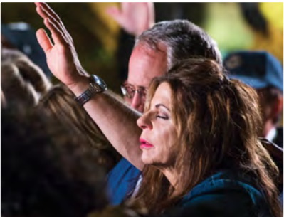
Partners worship and pray outside the Garden Tomb.