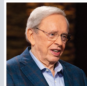
In Touch with Dr. Charles Stanley