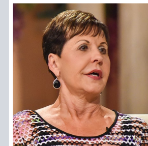
Joyce Meyer: Enjoying Everyday Life