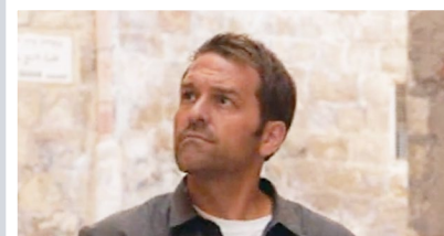
Drive Thru History: Acts to Revelation