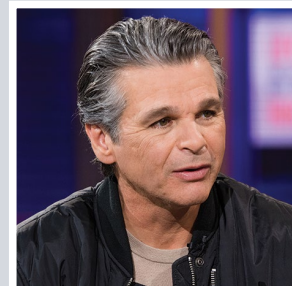
Kingdom Connection with Jentezen Franklin