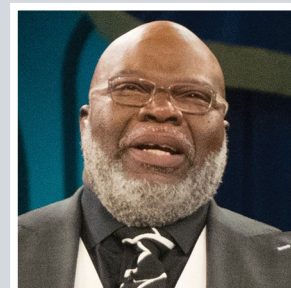
The Potter's Touch with T.D. Jakes