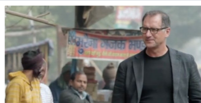
Jesus the Game Changer (Premieres this month!)