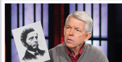
America's Hidden History