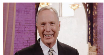
Max Lucado: Unshakable Hope