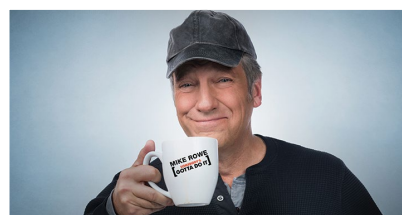
Mike Rowe: Somebody's Gotta Do It