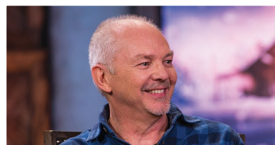
Restoring the Shack