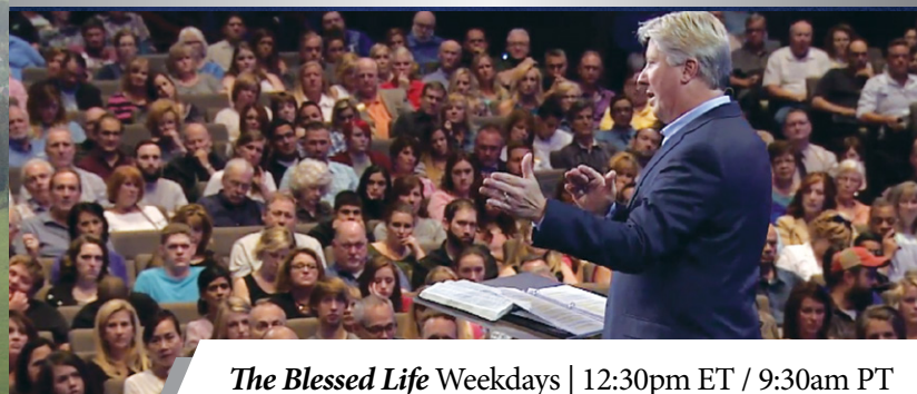
The Blessed Life Weekdays | 12:30pm ET / 9:30am PT Sundays | 7:30pm ET / 4:30pm PT