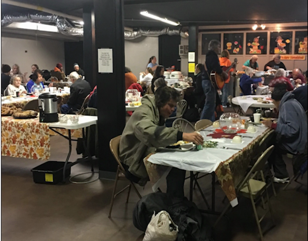
And finally a local ministry called Faith, Hope, and Love shared with us the way they help provide large amounts of food to those in need here in Indianapolis.