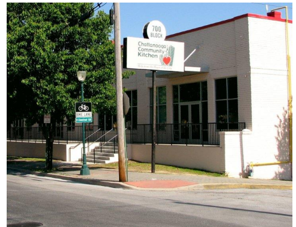
Right: Community Kitchen building