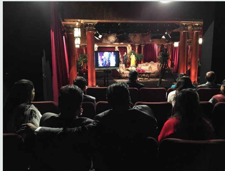
photo on left: our multi-media room (aka Studio B) was set to accommodate 70 guests at the JCTV Pakistan Christmas celebration.