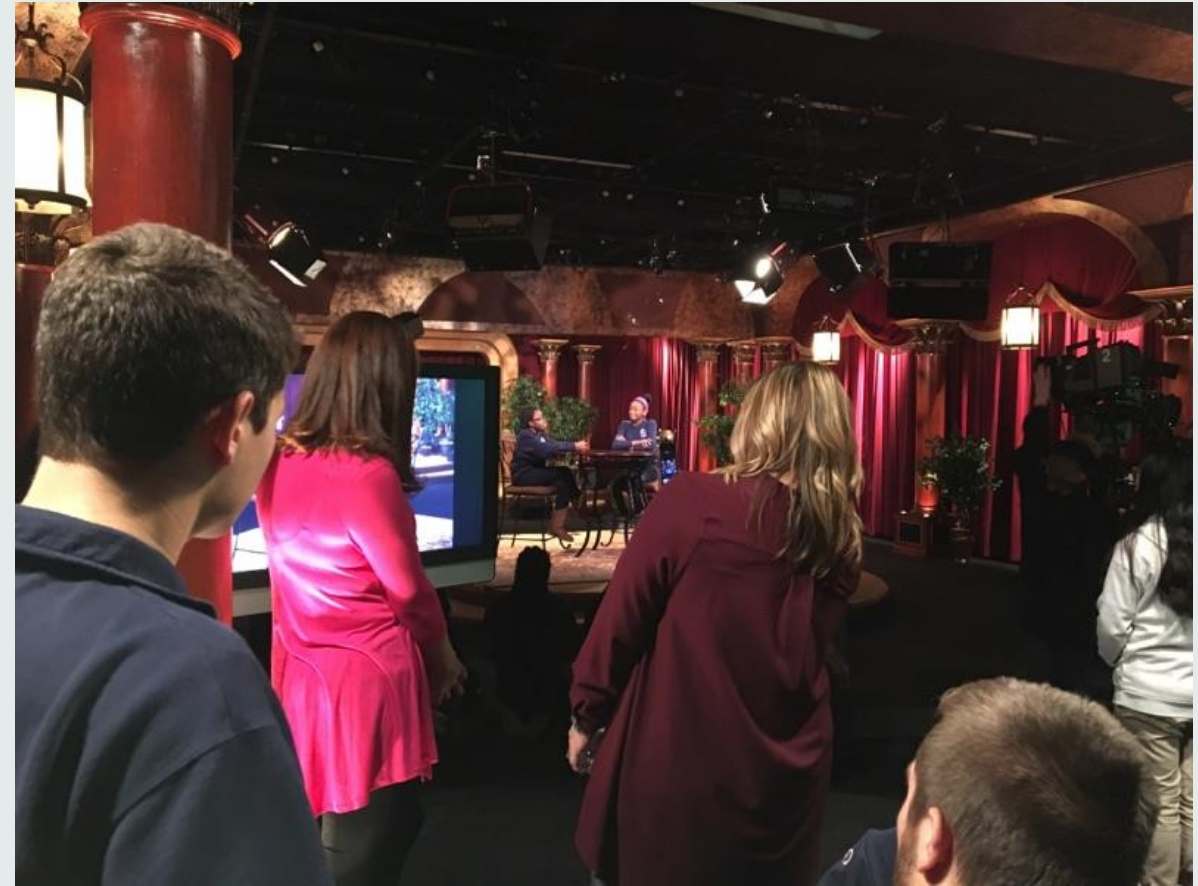
TCA instructors look on as the 7 th grade students take charge. They did a great job and had fun doing it.