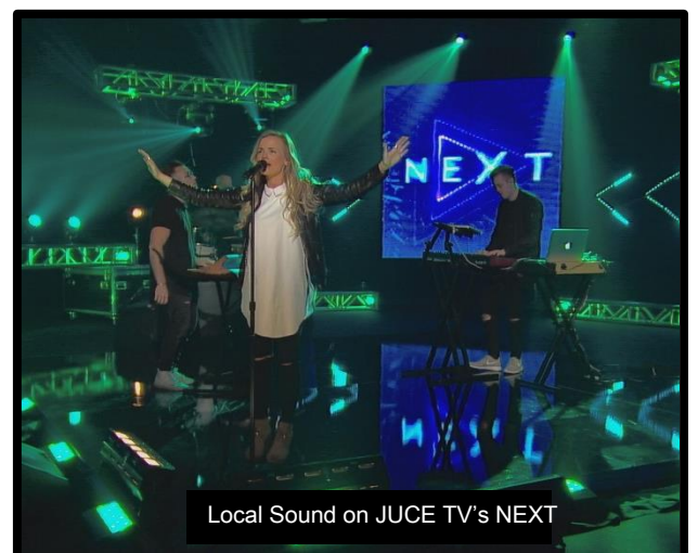
Local Sound on JUCE TV's NEXT

Although we were not doing many productions on-site with the holidays, our post-production department has been in high gear. Three NEXT shows for JUCE TV were completed and delivered, with the rest of the series currently being edited. We are also working on several conferences that will be airing on TBN.